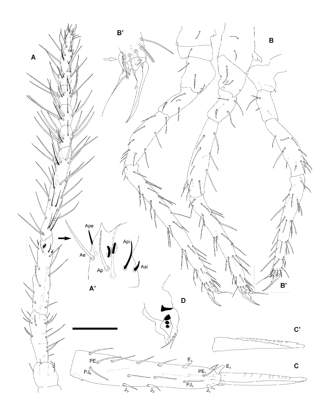
Figure 2. Arrhopalites miravetensis, sp. nov. (A) Antenna (A', detail of the apical sense organ); (B) Legs, leg I to the right (B', detail of the last row of leg I setae, unguis and unguiculus); (C) Furcula, posterior view (C', mucro lateral view drawing from SEM); (D) Tenaculum (scale line 0.1 mm for A, 5 μm for B-C).