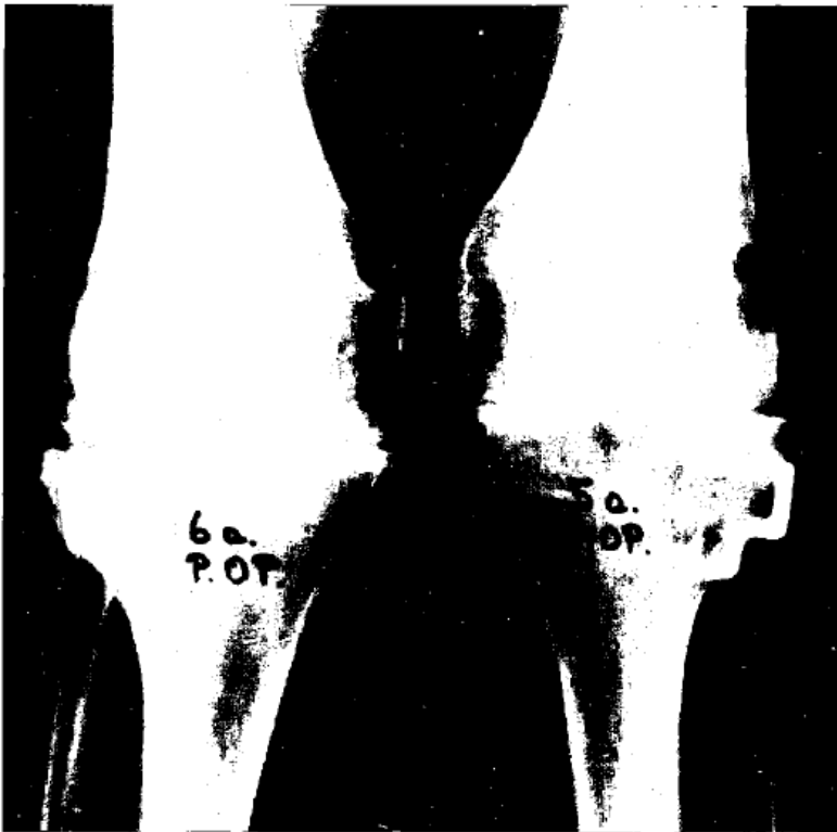
Figure 2. Radiograph showing overcorrection of more than 10^{\circ} , 6 years after operation; both knees were very painful