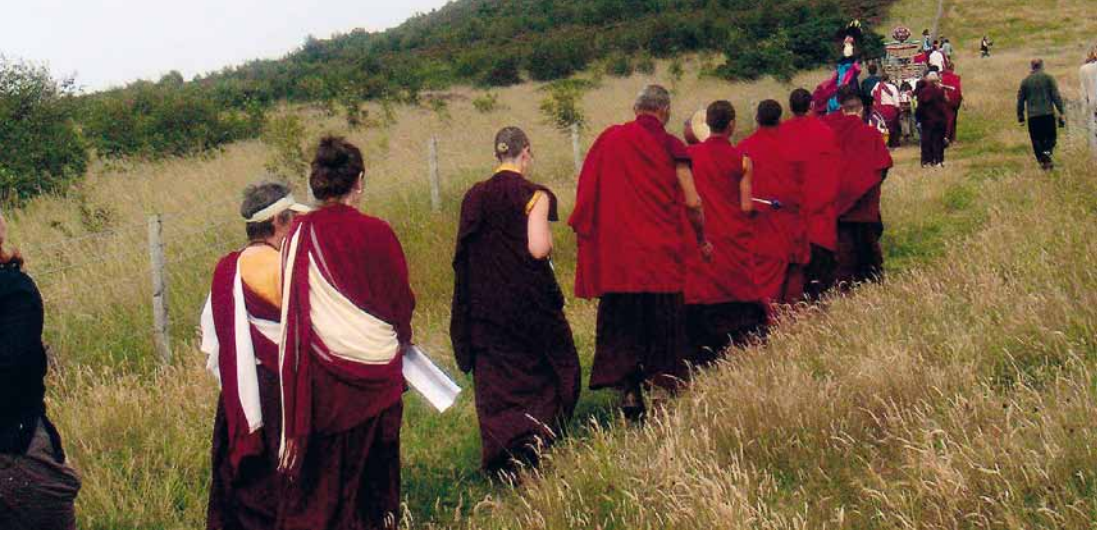
The Holy Island of Arran, UK. Tibetan Buddhist Pilgrimages walking in silence across the hills have become a feature of this Scottish landscape.