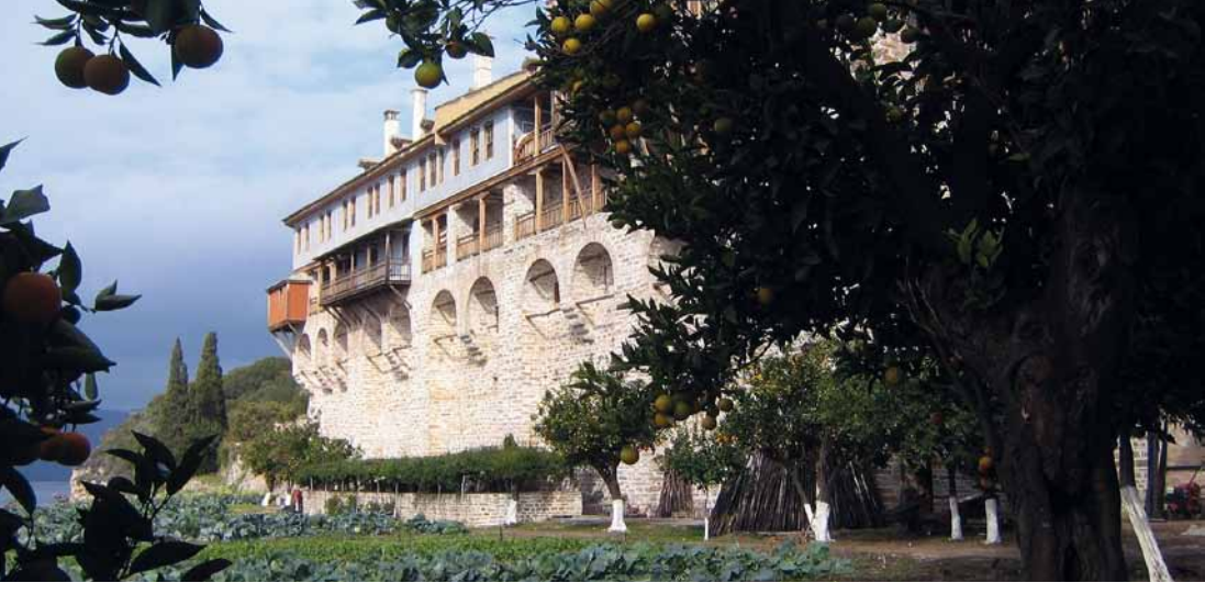
Well tended vegetable gardens and orchards like those near the monastery of Xenophontos, Athos.

which have remained almost unchanged until the present day: community life - cenobitic - and isolated life - hermitic. Hermitism and cenobitism are usually seen as complementary paths. Hermits are often fed by monastic communities, and in some monasteries all monks become hermits during some part of their lives. In other communities, a hermitic life is an option only for those who feel attracted to it. In any case, a hermit devoted to silent prayer and contemplation in solitude is the prototype of the human being in deep harmony with nature. In the words of one hermit, 'hermits live a cosmic experience of communion with nature' (Mouizon, 2001). No wonder, therefore, that from the fourth century onwards numerous historical records describe the lives and feats of holy monks and hermits who befriended wild animals, such as lions, bears, wolves or poisonous snakes, and it is recorded that some were even fed by them (Macaire, 1993). Similar phenom-