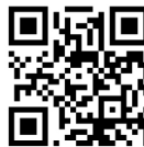
List of subject librarians

These librarians act as liaisons between the different departments and the Library for issues regarding training, acquisition of literary works, support and reference for bibliographic assessment.