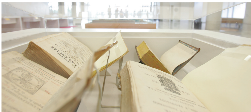
Special Collections exhibition in the entrance hall of the Main Library.

Library Services presents a number of exhibitions each year in the entrance hallway of the Main Library, in which we show our special collections. Online versions of these exhibitions are produced at the same time. There are 35 such virtual exhibitions currently available.