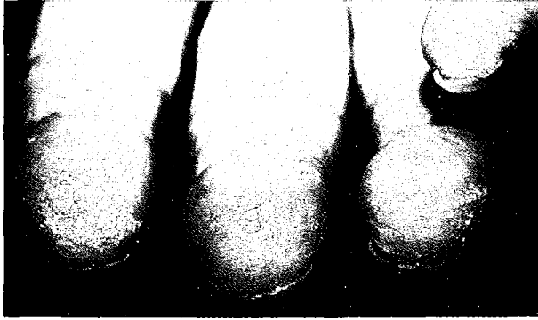
Figure 1. Fissured, yellowish, hyperkeratotic lesions located on the fingertips and distal lateral portions of the fingers.