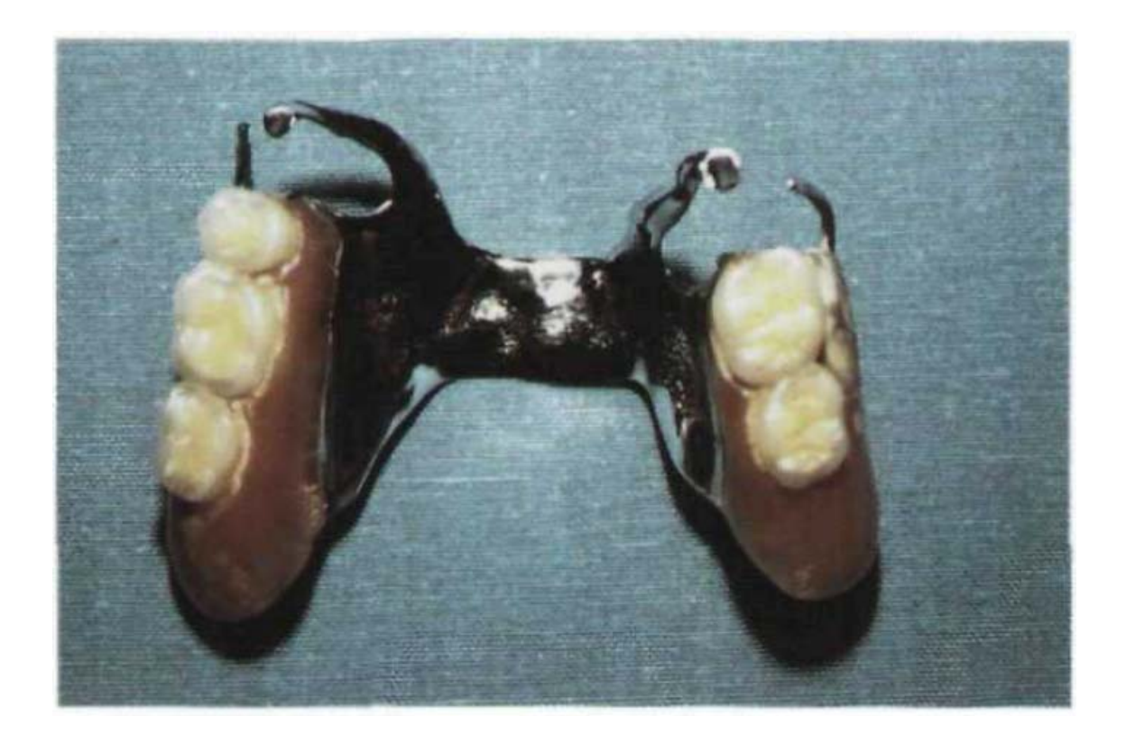
Figure 1. The partial removable dental prosthesis.