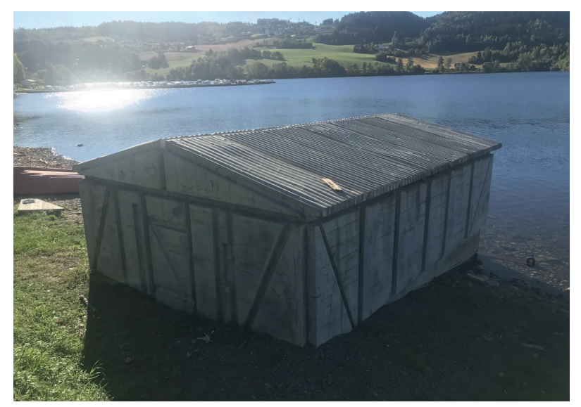
Fig. 10 The patina of Rachel Whiteread's The Gran Boat House (2010) at a lake north of Oslo, documents in concrete the weathered properties of the lost wooden structure and its corrugated led roof.

The practice of replicating art and architecture corroborates a profound hermeneutical definition of tradition as a process of continual reinvention. Exploring how the handing down of monuments and documents relies on their reactualization in interpretation, Hans-Georg Gadamer, in the most fundamental work on interpretation of the 20th century, argued that "ideas are formed in tradition," shaping relative meanings in a history conceived of as a fluctuating whole.<sup>28</sup> Seen as three-dimensional documents that are both documenting the life and shaping the afterlife of art and architecture, the plaster monuments tie back to the textual tradition prior to the birth of the author, the invention of originality, and the modern obsession with permanence and the unique. Salvatore Settis' repeatable, versatile, adjustable classics, ran parallel with a tradition in which documents were continuously transcribed and commented on.<sup>29</sup> Its ethos was captured by Erasmus in the early sixteenth century as "Friends Hold All Things in Common"—pointing to a world where repetition and invention were part of sharing something collectively owned.30 RA