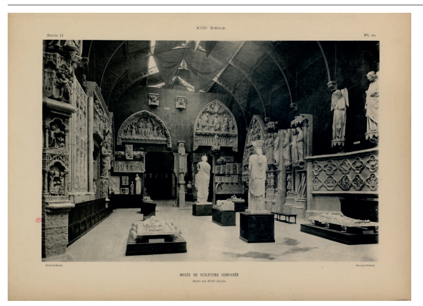
Fig. 05 A plaster cast from the Erechtheion caryatide purchased from the British Museum displayed in the twelfth-century gallery at the Musée de sculpture comparée, adjacent to the Smiling Angel from Reims Cathedral. From Paul Frantz Julien Marcou, Album du Musée de sculpture comparée, vol. 2 (Paris, 1897).