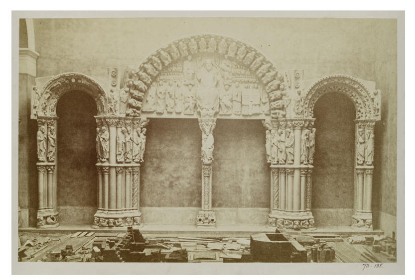
Fig. 04 Building Portico de la Gloria at the South Kensington Museum. Isabel Agnes Cowper, Cast of Portico de la Gloria; Archivolt of Central Doorway, the Cathedral at Santiago de Compostela in Spain. Albumen print, 1868. Courtesy of the Victoria and Albert Museum. London.

Cycled through time, the monuments became timely and were assigned their proper place in history by becoming exhibits. Testimony to a synchronizing contemporaneity, producing simultaneity in the perception of monuments from across time and place, the plaster monuments displayed a relativized and relational canon deprived of universal standards and historical absolutes. Selected, hierarchized and exhibited according to evolutionary theories, the monuments were appropriated into world history. The cast galleries worked as full-scale, three-dimensional encyclopedia of an emerging global history of national monuments that could be experienced spatially, synoptically, and simultaneously, as in a museum without walls.<sup>17</sup>