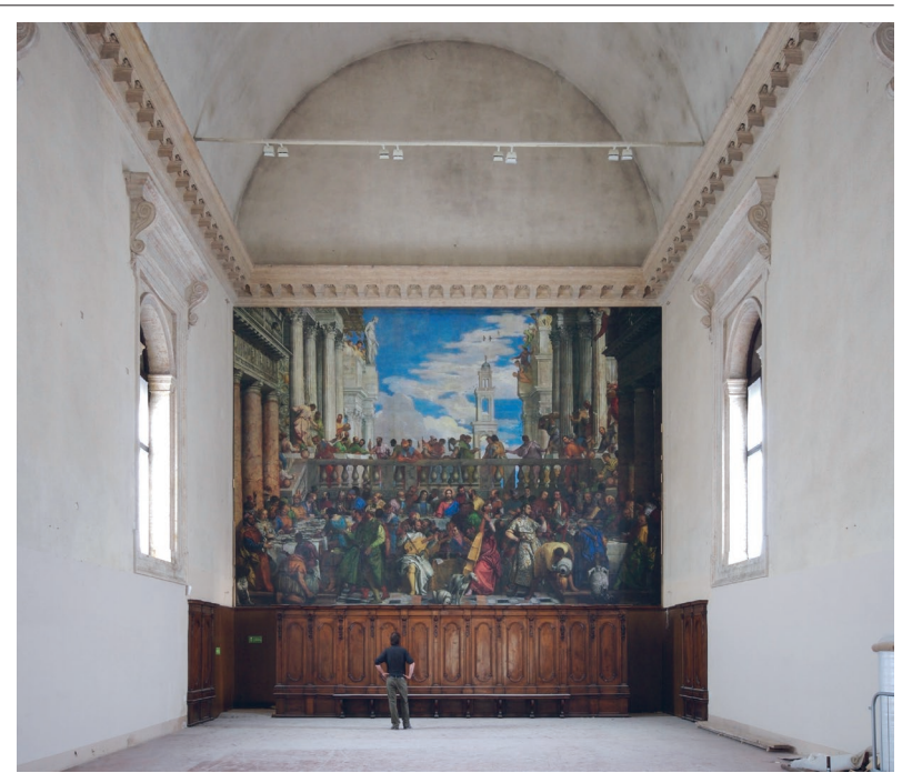
Fig. 06 The facsimile of The Wedding at Cana , created by Factum Arte in 2007 and installed in its original site at the refectory of San Giorgio Maggiore in Venice.