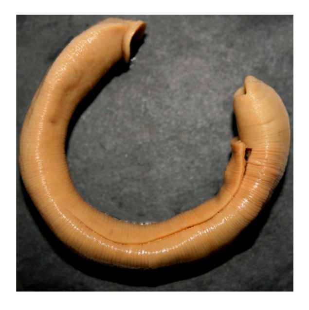
Figure 2. T. subviridis : habitus; specimen from Spain, Navarra. (Photo: C. Grosser). T. subviridis: habitus; ejemplar recogido en España, Navarra. (Foto: C. Grosser).

Benthic invertebrates were collected on 2 July 2010 along the upper stretch of Suspiro stream (Bidasoa River Basin, Navarra) as part of the project "Estudios de monitorización integrada en una cuenca forestal del Pirineo" conducted by the group of Biodiversity Data Analytics and Environmental Quality (BEQ), Department of Environmental Biology (University of Navarra). To collect freshwater invertebrates, we used a hand net with a mesh size of 500 µm. Furthermore, we conducted a visual analysis of the area to detect the animals with elusive behaviour. Physicochemical parameters as temperature, pH and dissolved oxygen concentration were also measured in situ with a multiparametric probe. In addition, to better characterise the habitat, other environmental