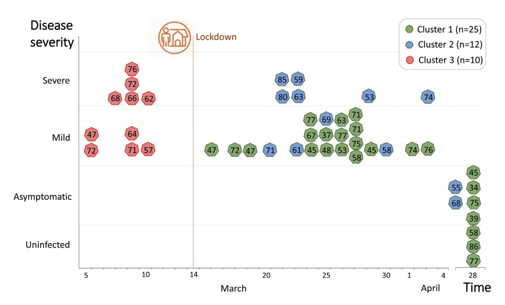
Fig. 1. The timeframe of SARS-CoV-2 infections and COVID-19 disease severity in persons belonging to groups with different viral exposure.

another four developed mild to severe symptoms, with one being hospitalized with bilateral pneumonia. Antibody tests on April 28 confirmed infection in all 12 residents, including two that had remained asymptomatic. In this cluster, indoor continuous viral exposure could account for a broader presentation of clinical forms of COVID-19, given that all residents were infected.